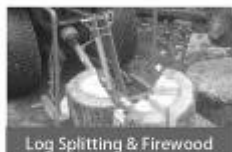
Log Splitting & Firewood

At SMV Contract Services we aim to cover all aspects of ground care within the Lincolnshire area.