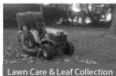
Lawn Care & Leaf Collection