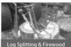
Log Splitting & Firewood

At SMV Contract Services we aim to cover all aspects of ground care within the Lincolnshire area.