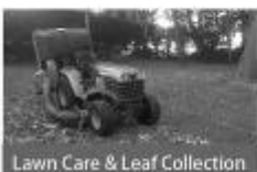
Lawn Care & Leaf Collection