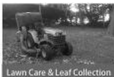
Lawn Care & Leaf Collection