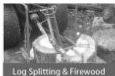
Log Splitting & Firewood

At SMV Contract Services we aim to cover all aspects of ground care within the Lincolnshire area.