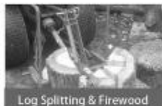
Log Splitting & Firewood

At SMV Contract Services we aim to cover all aspects of ground care within the Lincolnshire area.