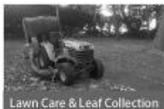
Lawn Care & Leaf Collection