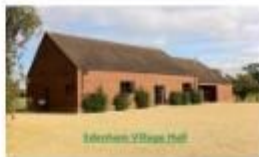
Edenhall Village Hall