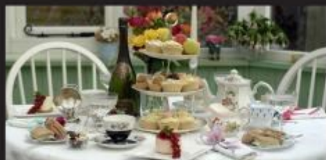
wedding breakfast • vintage teas