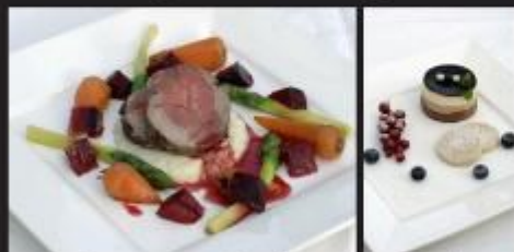
barbecues • cocktail parties • picnics