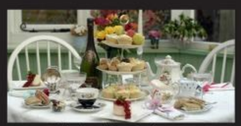
wedding breakfast . vintage teas