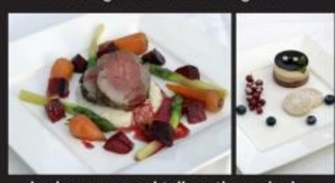
barbecues • cocktail parties • picnics