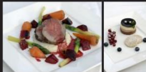
barbecues • cocktail parties • picnics