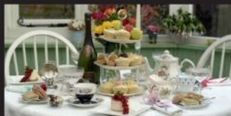
wedding breakfast • vintage teas