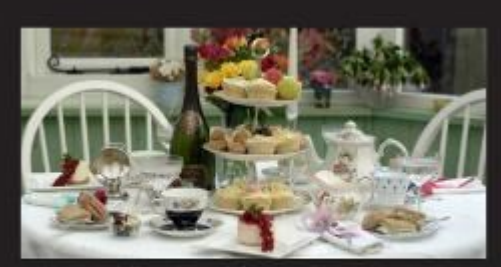
wedding breakfast - vintage teas

If you wish to comment on the Draft Local Plan and supporting documents, please ensure that comments are received by the Council by 11:59pm Thursday 25<sup>th</sup> April 2024.