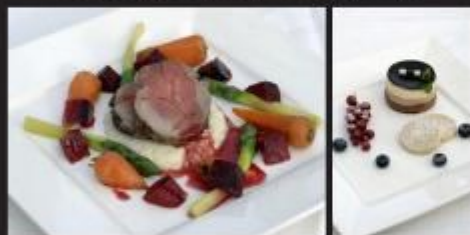
barbecues • cocktail parties • picnics