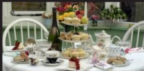
wedding breakfast • vintage teas

ANTS PIGEONS MOTHS WOODWORM FOX CONTROL BIRDPROOFING BEDBUGS