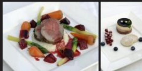
barbecues • cocktail parties • picnics