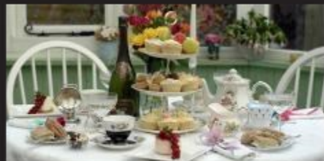
wedding breakfast • vintage teas